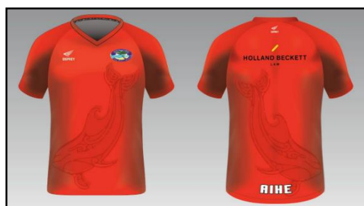
Holland Beckett Aihe

All children will be in a house group with siblings are in the same house group. All new children to the school will be given a house shirt which can be worn each Friday when we have house group activities. If your child needs a new house shirt they can be ordered online in the Osprey Shop.