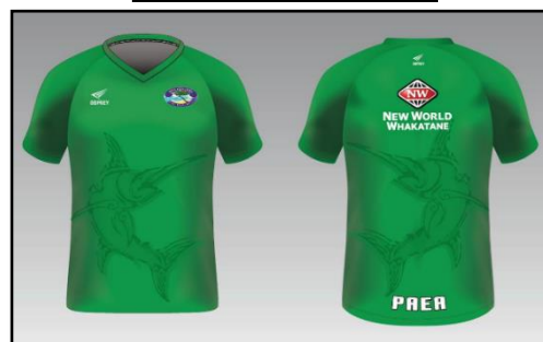
New World Paea