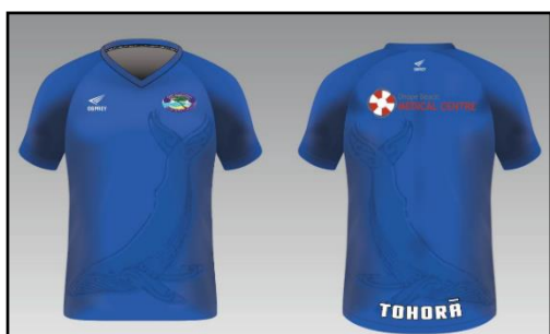
Ōhope Medical Centre Tohorā