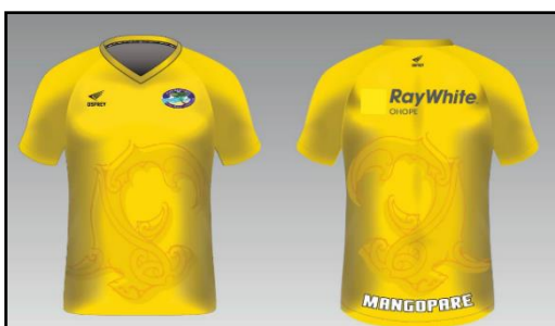
Ray White Real Estate Mangōpare