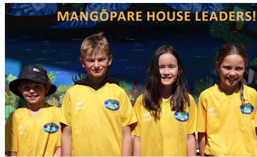
MANGŌPARE HOUSE LEADERS!