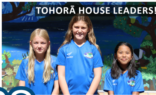
TOHORĀ HOUSE LEADERS!