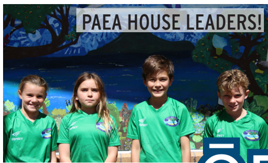
PAEA HOUSE LEADERS!