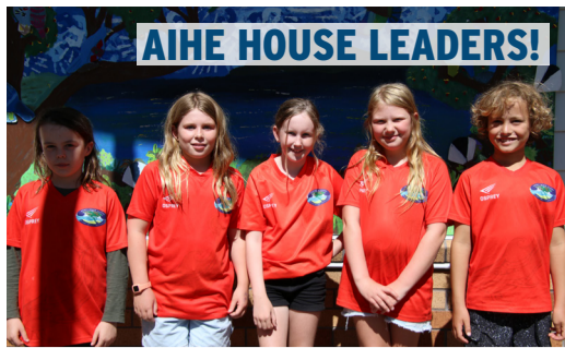
AIHE HOUSE LEADERS!