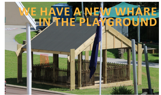
WE HAVE A NEW WHARE IN THE PLAYGROUND