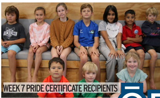
WEEK 7 PRIDE CERTIFICATE RECIPIENTS