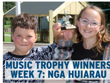
MUSIC TROPHY WINNERS WEEK 7: NGA HUIARAU