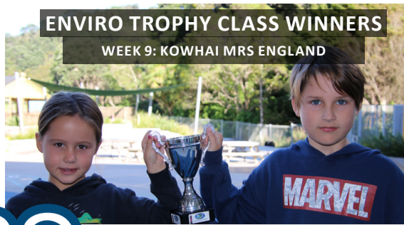
ENVIRO TROPHY CLASS WINNERS