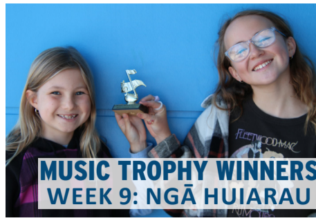
MUSIC TROPHY WINNERS WEEK 9: NGĀ HUIARAU