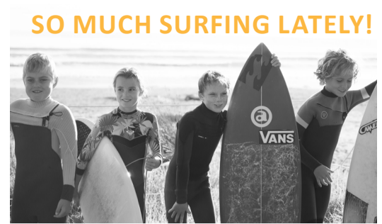
SO MUCH SURFING LATELY!