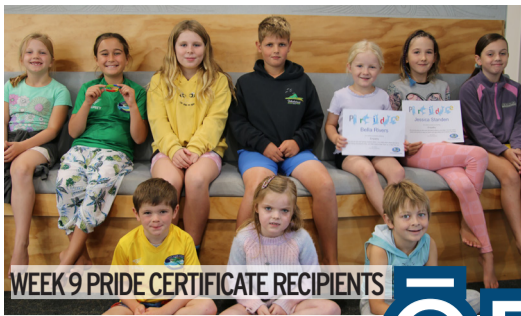
WEEK 9 PRIDE CERTIFICATE RECIPIENTS