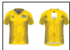
Ray White Real Estate Mangōpare

P ositivity R espect I ntegrity D iligence E mpathy