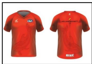
Holland Beckett Aihe