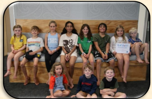
Pride Certificate Week 6