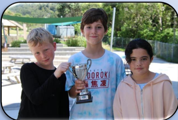
Week 5 – Ngā Huiarau

Each week a trophy is awarded to a learning space for looking after their environment both inside and outside. Thank you to all the children for modelling kaitiakitanga in our school.