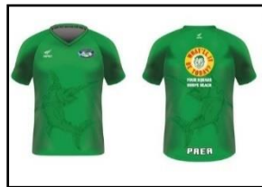
Four Square Paea