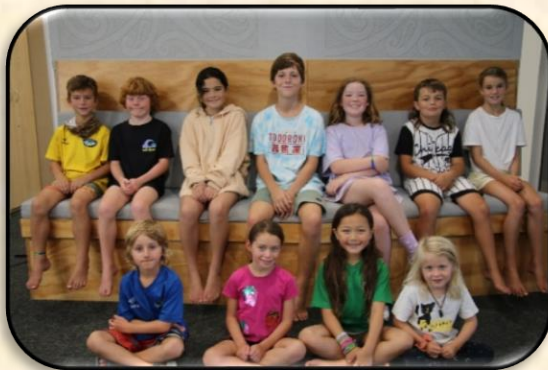
Pride Certificate Week 5

Congratulations to the students who have received a Pride Certificate for demonstrating our Pride values at school. Great work everyone.