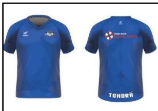
Ōhope Medical Centre Tohorā

Thank you to our House Groups Sponsors who enable us to have house shirts for the students.