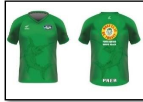
Four Square Paea