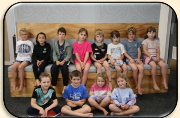
Pride Certificates Week 9 & 10

We do not have our Ngā Huiarau students in the photo as they were away at camp.