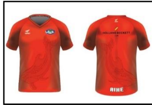
Holland Beckett Aihe