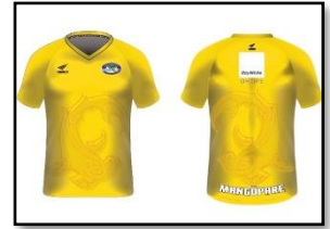
Ray White Real Estate Mangōpare

P ositivity R espect I ntegrity D iligence E mpathy