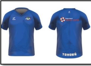
Ōhope Medical Centre Tohorā

Thank you to our House Groups Sponsors who enable us to have house shirts for the students.