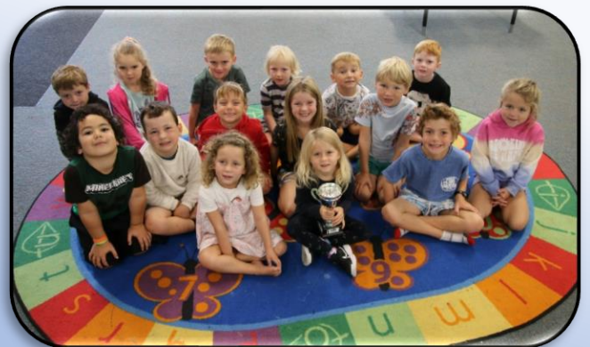
Week 10 – Manuka

We look forward to next term and our Kauri classes being upgraded.