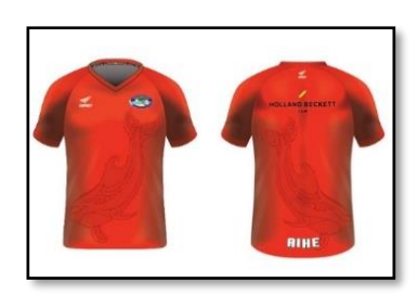
Holland Beckett Aihe