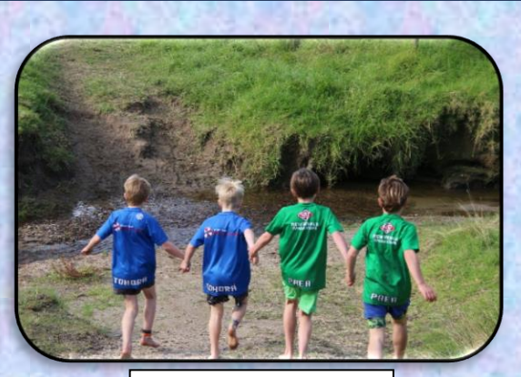
Teams race action.