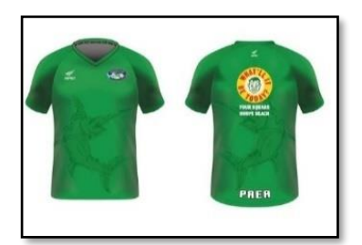
Four Square Paea