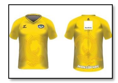
Ray White Real Estate Mangōpare