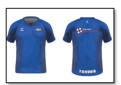
Ōhope Medical Centre Tohorā

Thank you to our House Groups Sponsors who enable us to have house shirts for the students.