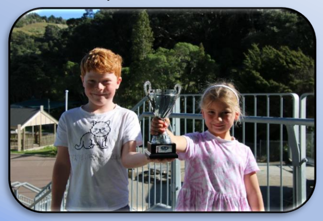
Week 2: Kahikatea

Each week a trophy is awarded to a learning space for looking after their environment both inside and outside. Thank you to all the children for modelling kaitiakitanga in our kura.