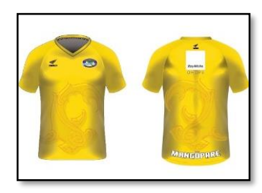
Ray White Real Estate Mangopare