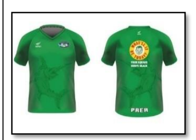
Four Square Ray White