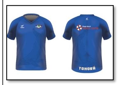
Ōhope Medical Centre Tohorā

Thank you to our House Groups Sponsors who enable us to have house shirts for the students.