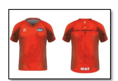
Holland Beckett Aihe