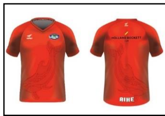
Holland Beckett Aihe