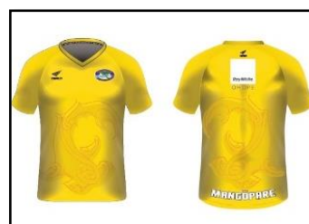
Ray White Real Estate Mangōpare