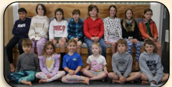
Pride Certificates Week 3