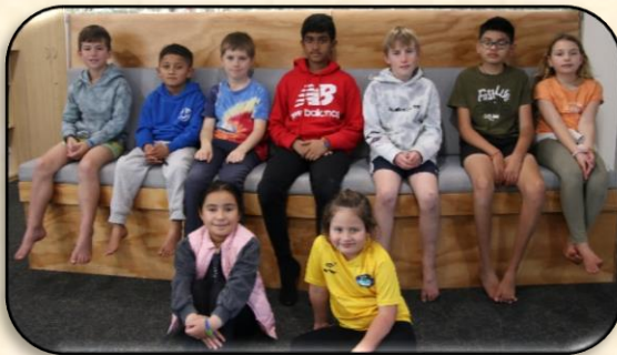
Pride Certificates Week 1

Congratulations to the students who have received a Pride Certificate for demonstrating our Pride values at school. Great work everyone. Keep up the excellent work as the term progresses.