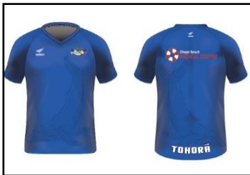
Ōhope Medical Centre Tohorā

Thank you to our House Groups Sponsors who enable us to have house shirts for the students.