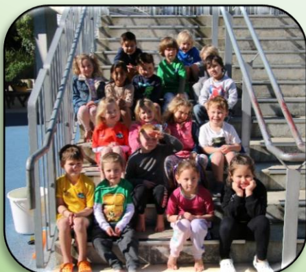
Week 2: Manuka

Each week a trophy is awarded to a learning space for looking after their environment both inside and outside. Thank you to all the children for modelling kaitiakitanga in our kura.