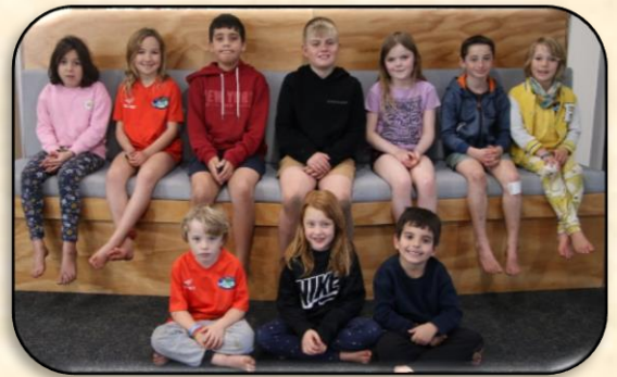
Pride Certificates Week 2