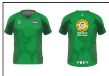
Four Square Paea