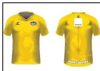
Ray White Real Estate Mangōpare