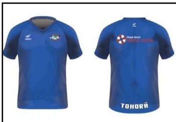
Ōhope Medical Centre Tohorā

Thank you to our House Groups Sponsors who enable us to have house shirts for the students.