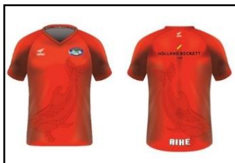
Holland Beckett Aihe