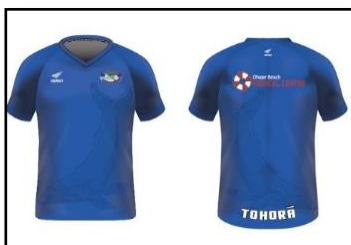
Ōhope Medical Centre Tohorā

Thank you to our House Groups Sponsors who enable us to have house shirts for the students.