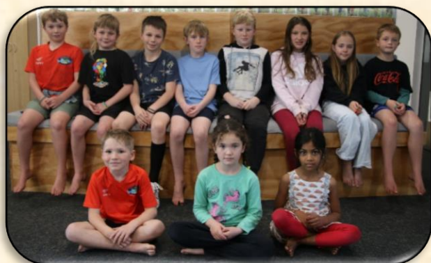
Pride Certificates Week 6