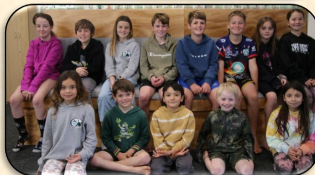
Pride Certificates Week 7