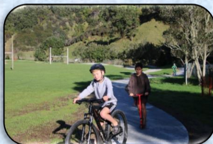
New bike track in action. The children are enjoying the new track and the chance to be out in the sunshine.