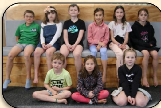
Pride Certificates Week 5

Congratulations to the students who have received a Pride Certificate for demonstrating our Pride values at school. Great work everyone. Keep up the excellent work as the term progresses.