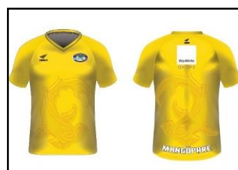
Ray White Real Estate Mangōpare