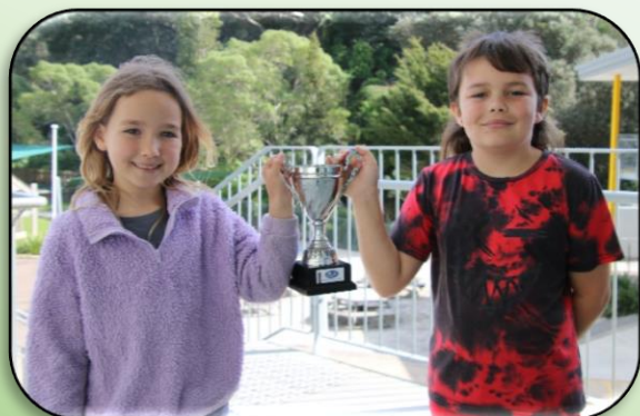
Week 6: Kahikatea

Each week a trophy is awarded to a learning space for looking after their environment both inside and outside. Thank you to all the children for modelling kaitiakitanga in our kura.