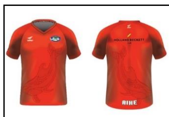
Holland Beckett Aihe