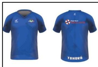
Ōhope Medical Centre Tohorā

Thank you to our House Groups Sponsors who enable us to have house shirts for the students.