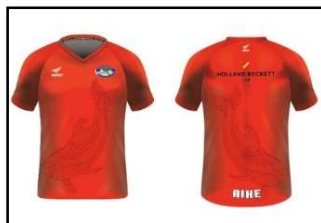
Holland Beckett Aihe