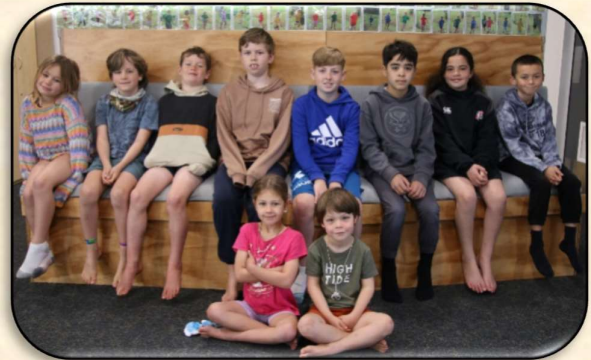
Pride Certificates Week 9