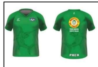
Four Square Paea