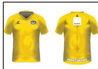
Ray White Real Estate Mangōpare