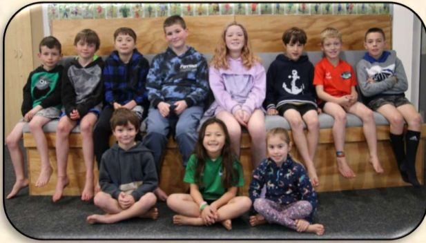
Pride Certificates Week 8

Congratulations to the students who have received a Pride Certificate for demonstrating our Pride values at school. Great work everyone. Keep up the excellent work as the term comes to an end.