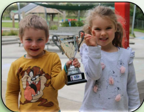
Week 8: Manuka

Each week a trophy is awarded to a learning space for looking after their environment both inside and outside. Thank you to all the children for modelling kaitiakitanga in our kura.