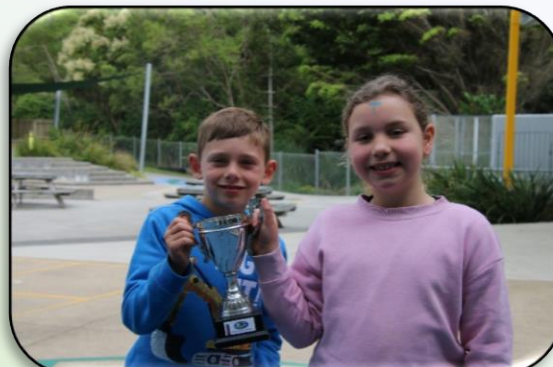
Week 1: Kowhai