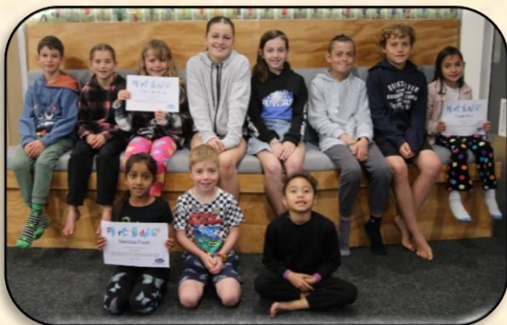
Pride Certificates Week 10 – Term 3

Congratulations to the students who have received a Pride Certificate for demonstrating our Pride values at school. Great work everyone. Keep up the excellent work for the rest of the year.