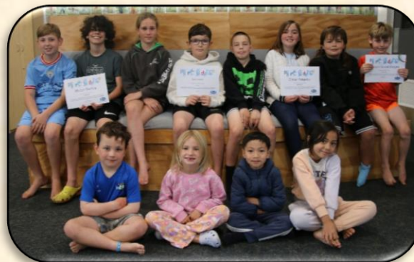
Pride Certificates Week 1 – Term 4