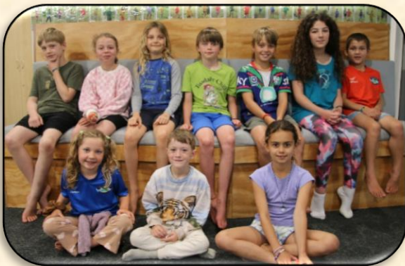
Pride Certificates Week 4

Congratulations to the students who have received a Pride Certificate for demonstrating our Pride values at school. Great work everyone. Keep up the excellent work for the rest of the year.