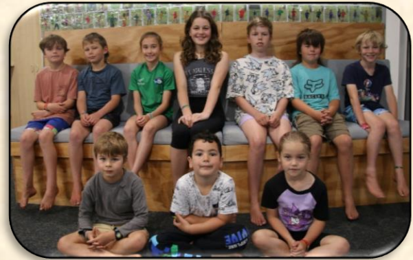
Pride Certificates Week 5