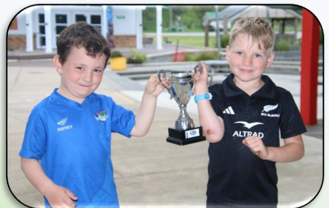
Week 5- Manuka

P ositivity R espect I ntegrity D iligence E mpathy