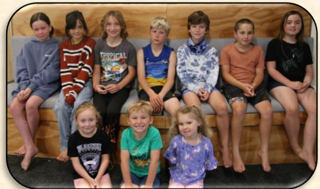
Pride Certificates Week 7