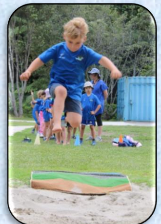
Te Tiwai Athletics Demonstration