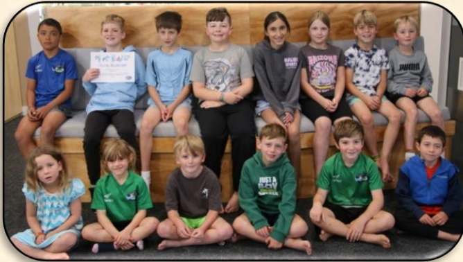
Pride Certificates Week 6

Congratulations to the students who have received a Pride Certificate for demonstrating our Pride values at school. Great work everyone. Keep up the excellent work for the rest of the year.