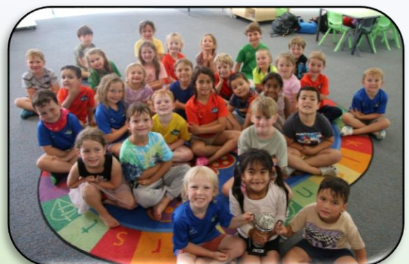
Week 7- Manuka

P ositivity R espect I ntegrity D iligence E mpathy