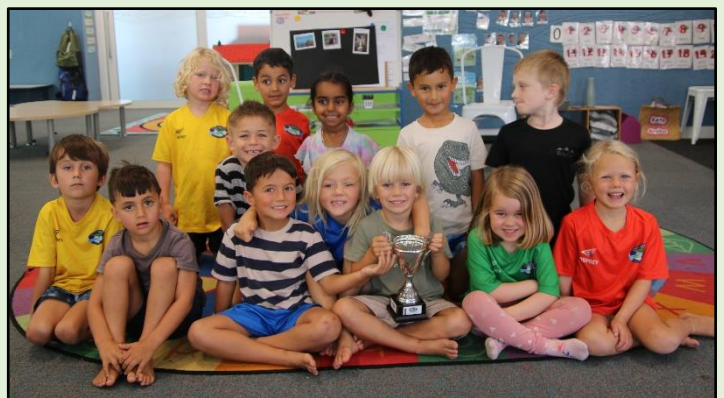
Week 3 Manuka

P ositivity R espect I ntegrity D iligence E mpathy