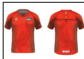
Holland Beckett Aihe