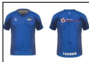
Ōhope Medical Centre Tohorā