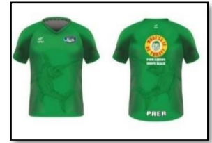
Four Square Paea