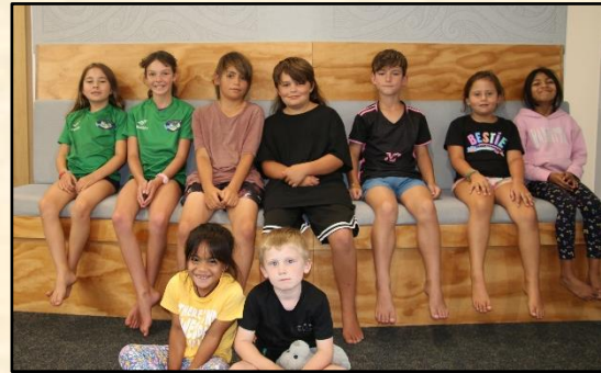
Pride Certificates Week 3