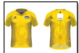
Ray White Real Estate Mangōpare

Thank you to our House Groups Sponsors who enable us to have house shirts for the students.