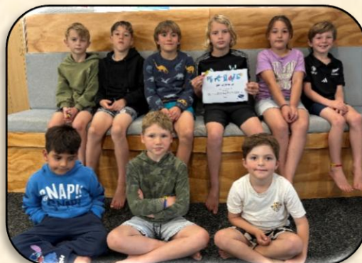
Pride Certificates Term 4 Week 2

Congratulations to the students who have received a Pride Certificate for demonstrating our Pride values at school. Great work everyone. Keep up the excellent work for the rest of the year.