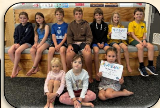
Pride Certificates Term 4 Week 3