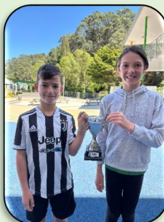
Term 4 Week 2 Kahikatea

Thank you to all the children for modelling kaitiakitanga in our kura, we look forward to seeing you model his throughout the term.