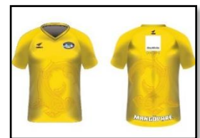
Ray White Real Estate Mangōpare

Thank you to our House Groups Sponsors who enable us to have house shirts for the students.