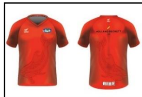
Holland Beckett Aihe