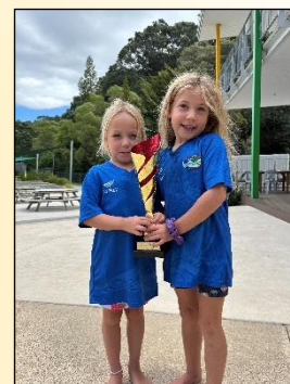
Week 5 Manuka

P ositivity R espect I ntegrity D iligence E mpathy